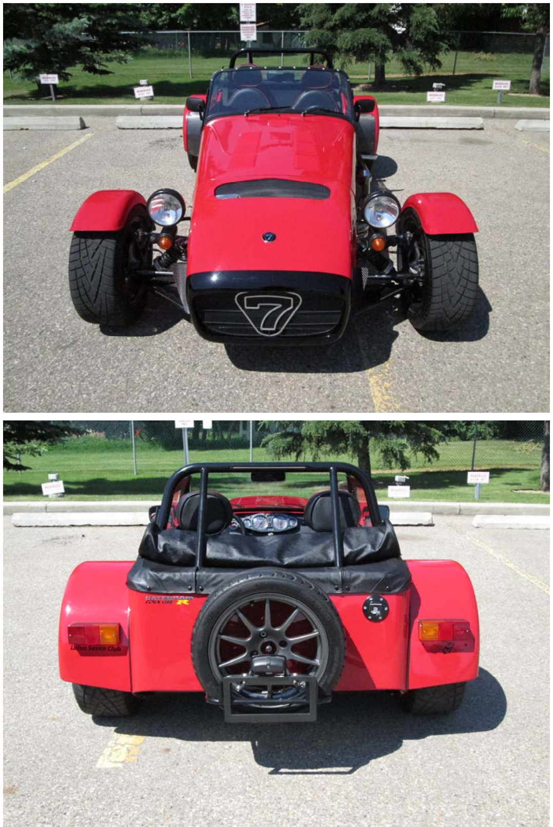
Freelance Appraisals Inc.