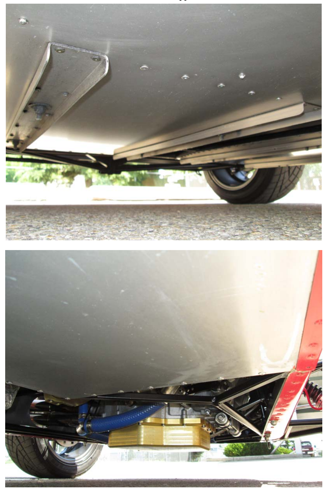
Freelance Appraisals Inc.