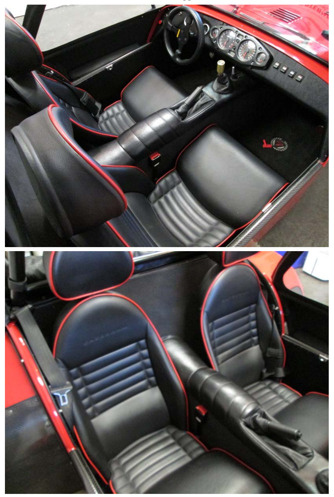
Freelance Appraisals Inc.